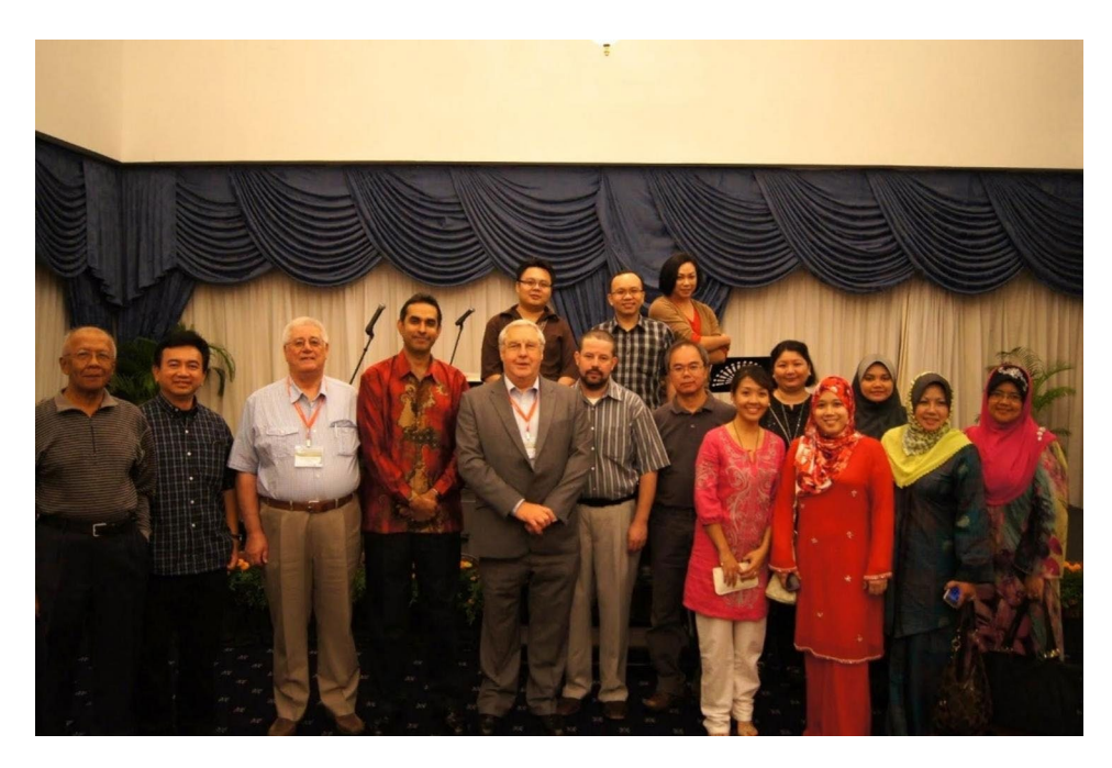
Fig. 3 The 1<sup>st</sup> MyCOT's organizing committee with international speakers

Kamaludin et al. Genes and Environment (2023) 45:34 Page 4 of 8