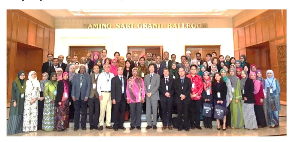
Fig. 4 The 2<sup>nd</sup> MyCOT held at The Royale Chulan Hotel, Kuala Lumpur, Malaysia in 2015