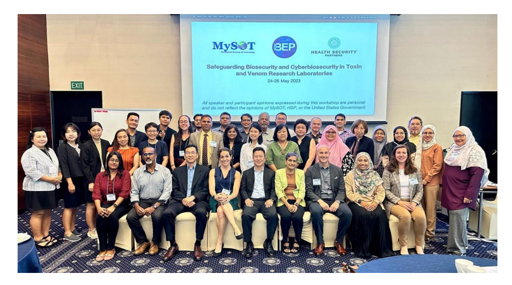
Fig. 9 Participants and speakers of the Safeguarding Biosecurity and Cyberbiosecurity in Toxin and Venom Research Laboratories workshop in Singapore, 2023

Kamaludin et al. Genes and Environment (2023) 45:34 Page 7 of 8