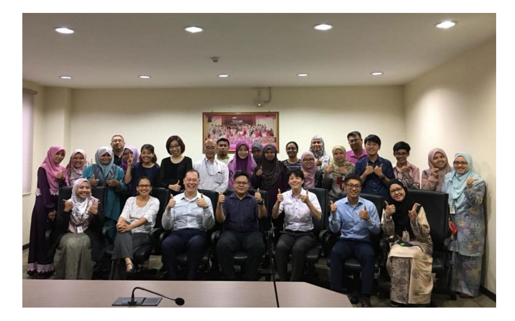
Fig. 8 The speaker and participants of the Skin Corrosion Testing Demonstration Workshop

solutions for a sustainable future in our communities and the environment.