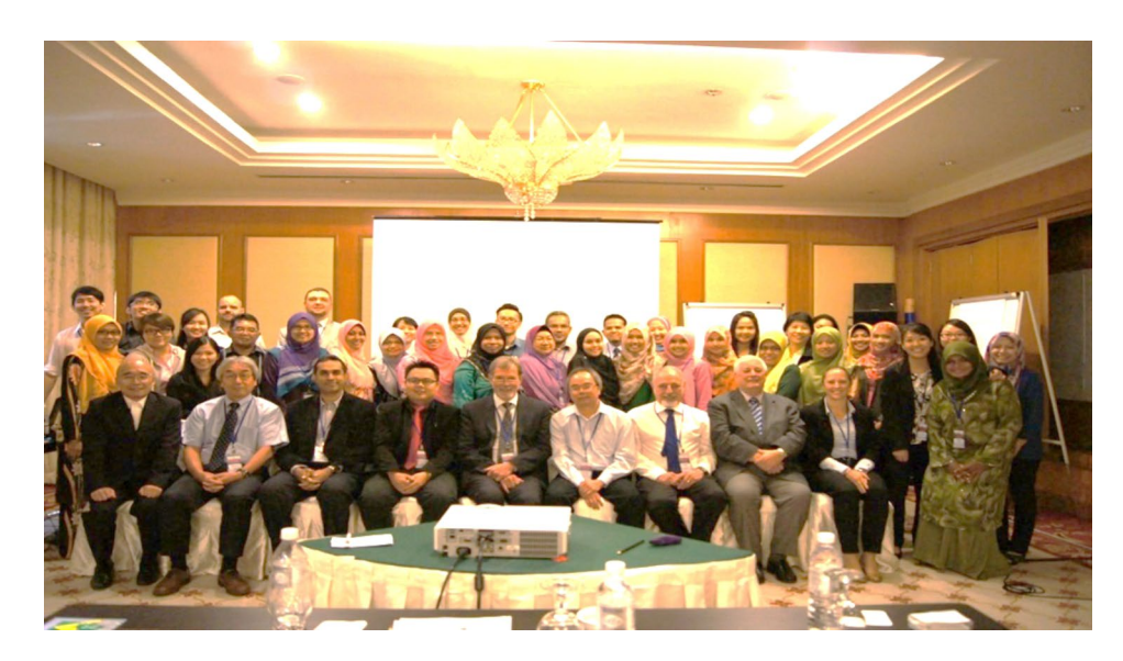
Fig. 7 The participants and speakers of the Oil Spill Health and Ecotoxicological Effects and Risk Assessment Workshop conducted in Kuala Lumpur, Malaysia in 2014

Kamaludin et al. Genes and Environment (2023) 45:34 Page 6 of 8